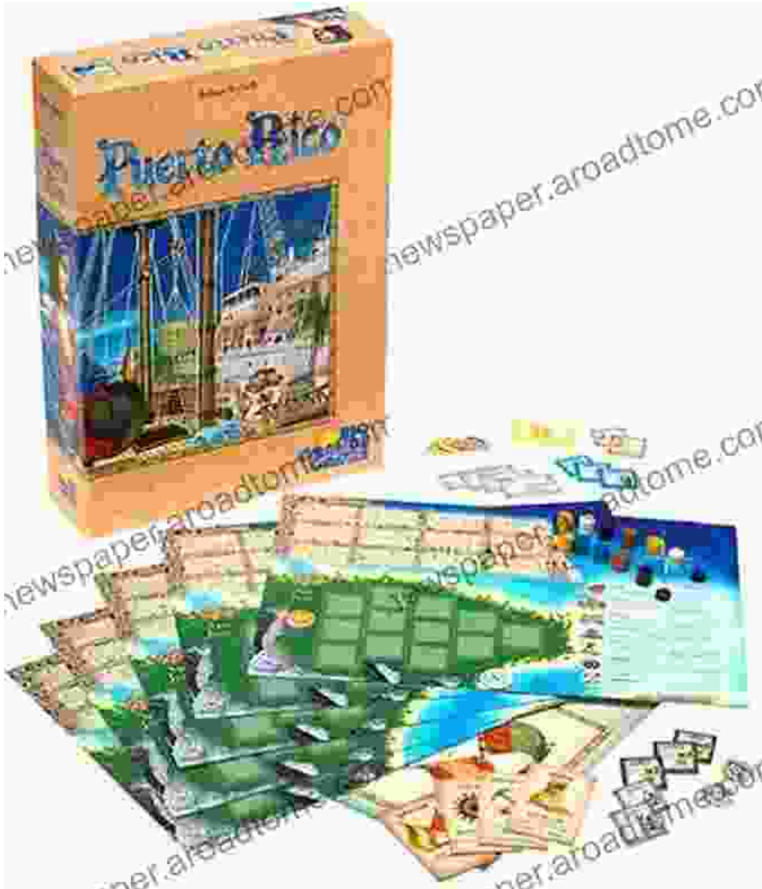
Puerto Rico: A complex and engaging game of colonial resource management.