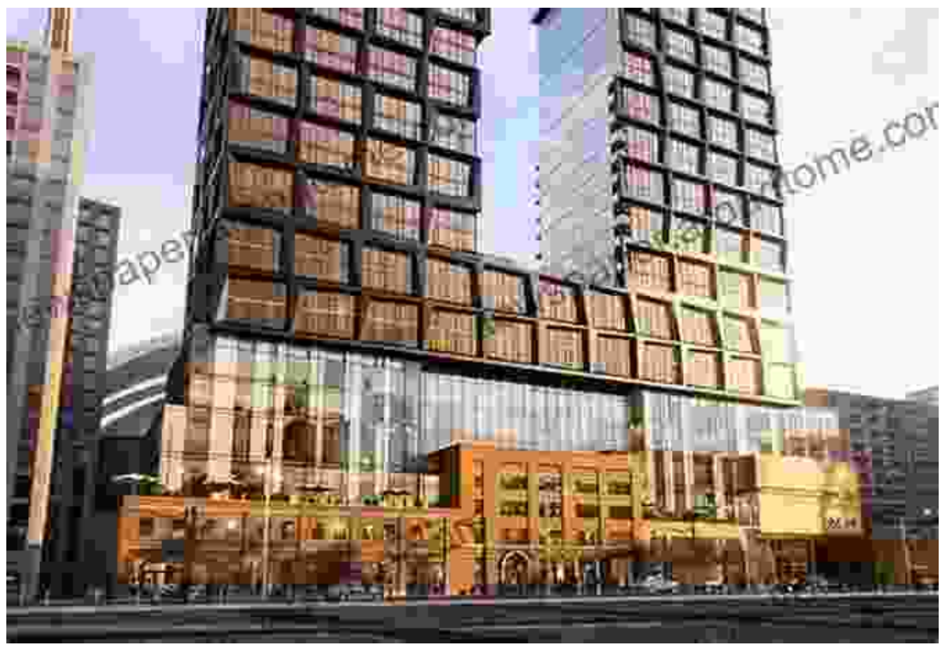
Historical Origins and Controversies

The concept of Facadism has a long history, dating back to the 19th century. However, its widespread adoption occurred in the 20th century, particularly in Europe. This practice has since sparked considerable debate, with proponents highlighting its potential to preserve architectural landmarks while critics express concerns about the authenticity and structural integrity of the resulting buildings.