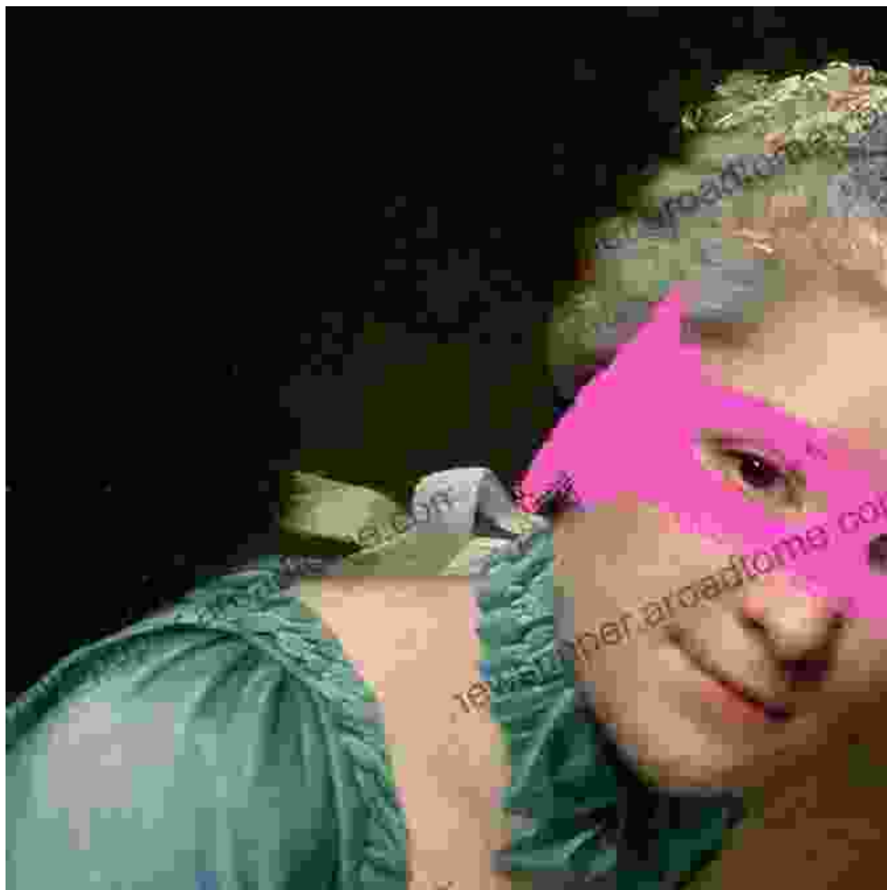
Example of Altered Art from Altered Art 35 by John Saunders

Whether you're interested in experimenting with collage, painting, or mixed media, Altered Art 35 provides a comprehensive roadmap to guide you on your artistic journey. With its detailed instructions, troubleshooting tips, and abundance of creative inspiration, this book will help you unlock your inner artist and unleash the full potential of your imagination.