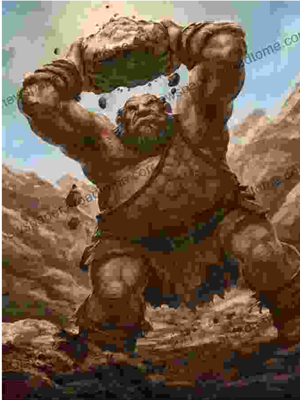
A Mighty Giant from Ancient Lore